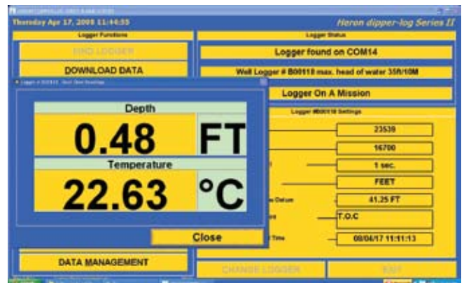
SHOWING REAL TIME READINGS

If a Heron barLog has not been used, the compensation will default to the initial value measured automatically during the setup. The barLog may be downloaded at any time during data collection. An example of the effort Heron has made to make the program ultra user friendly is that the program can be operated without using the mouse or cursor. Each instruction on the program has one character underlined. Press Alt and the key for that character and the program responds.